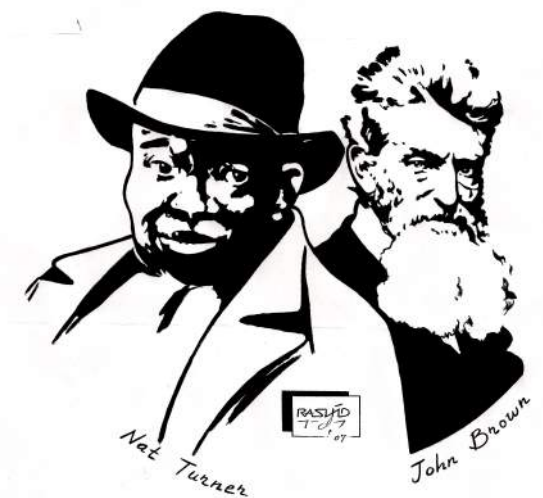
art credit: http://rashidmod.com/

When eyes are burning with mace, when blood is dripping down the face, it all becomes frighteningly clear: Capitalism is a sham; and whether in or out (of prison), as long as we live under a system that views everything and everybody as a commodity, we're all doing time. And that, at the end of the day, is the real crime--not that some of us are locked up but none of us are free!