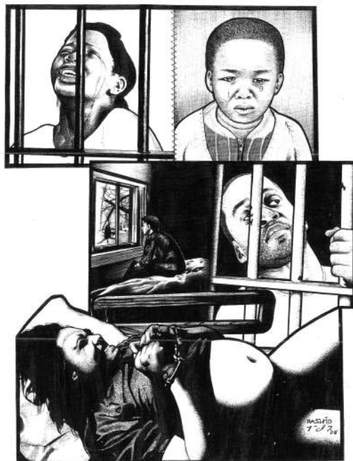
art credit: http://rashidmod.com/