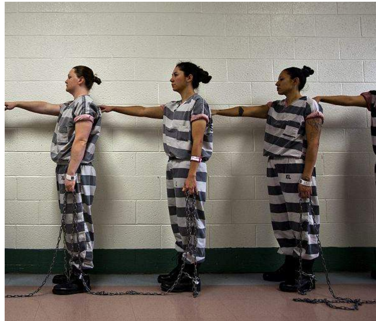
A PROJECT OF THE INCARCERATED WORKERS ORGANIZING COMMITTEE OF THE INDUSTRIAL WORKERS OF THE WORLD